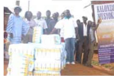
Distribution of relief food and certified seeds in Kilome district.

The Kalonzo Musyoka Foundation is an organization dedicated to the improvement of quality of life for all, alleviation of poverty, provision of healthcare and promotion of justice, peace, cultural values, human rights, democracy and conservation of environment.