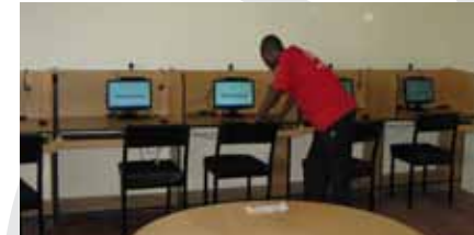
Tseikuru digital village

has been engaged in conflict resolution in Somalia and Sudan. In deed the Foundation through its founder and patron